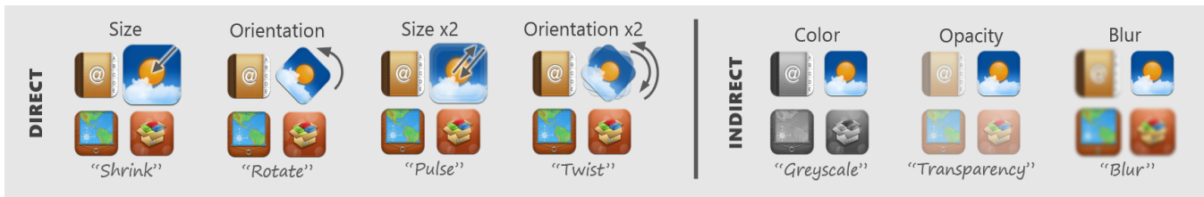
Figure 1: Direct and indirect ephemeral highlighting effects applied to the predicted weather icon (top right icon). The other three icons are non-predicted. Each effect is labelled with its corresponding preattentive visual property (top), and the name we used to describe it to participants (bottom, in quotes). The arrows indicate how the direct highlighted icons change over time.

ephemeral highlighting and which do not. The two most promising visual effects that emerged are Twist (icon rotates back and forth) and Pulse (icon grows and shrinks), as shown in Figure 1. Our experiment shows that these two effects significantly improve search performance over a control condition with no highlighting, independent of the number of pages of icons and the accuracy of the predication algorithm used. Pulse is also subjectively preferred to Twist and the control condition.