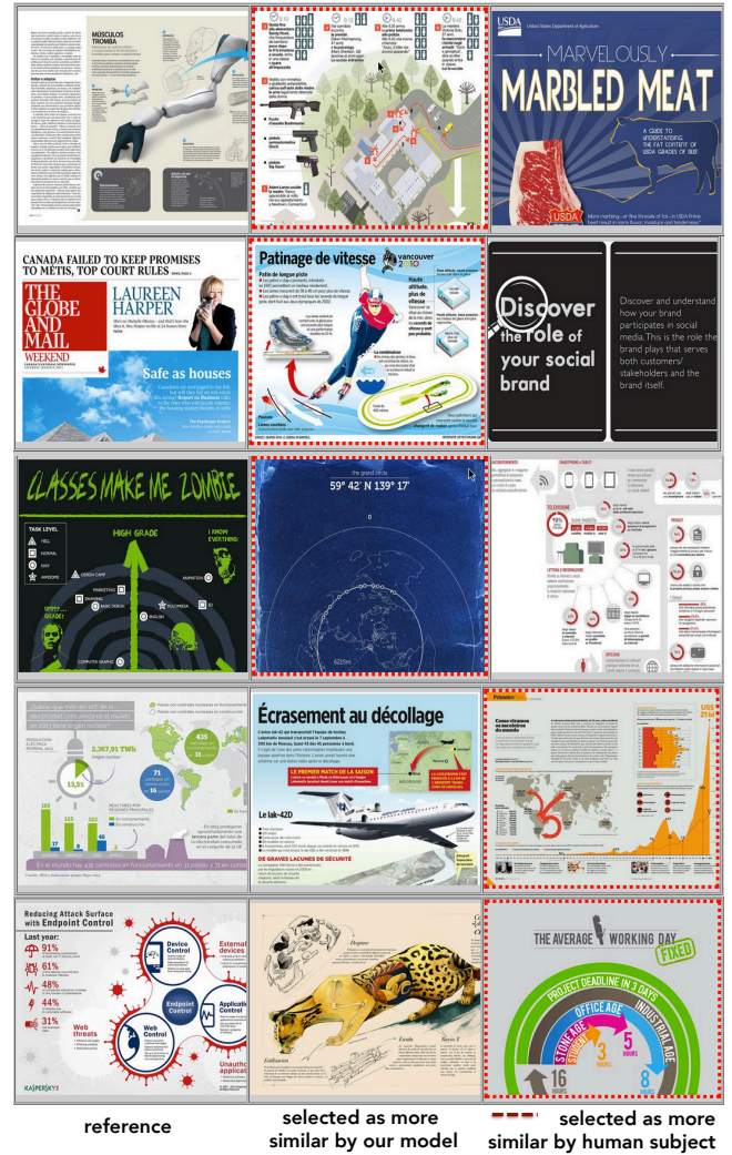
Figure 3: Qualitative evaluation of the learned metric for the task similarity prediction. The first three rows show success cases, and the last two rows show failures of our model in predicting the more similar pair. In each row, the image on the left is the reference image. The middle image is the option that the model predicts to be more stylistically similar. The red dotted bounding box shows the human preference (what the majority of users picked).

To evaluate the different visual features, we compute accuracy through the percentage of correctly-predicted triplets. Table 3 shows that color histograms perform remarkably well. Color works better than all other low-level visual features. It also performs better than the more sophisticated approaches, such as similarity features for clip art and higher-level object-classifier methods. Surprisingly, combining features does not always work better. While we achieve highest accuracy by combining color histogram and HoG-16 at 71.83%, adding GIST, LBP, or HoG-32 does not improve accuracy and sometimes even lowers it. We suspect that GIST brings down accuracy, because it overwhelms the color histogram features and itself includes color-based elements. HoG and LBP features are not correlated with color (designed to be color invariant), and thus we would expect them to complement the color histogram features. And indeed the small window size of HoG-16 features as compared to HoG-32 leads them to capture details at the right level. With