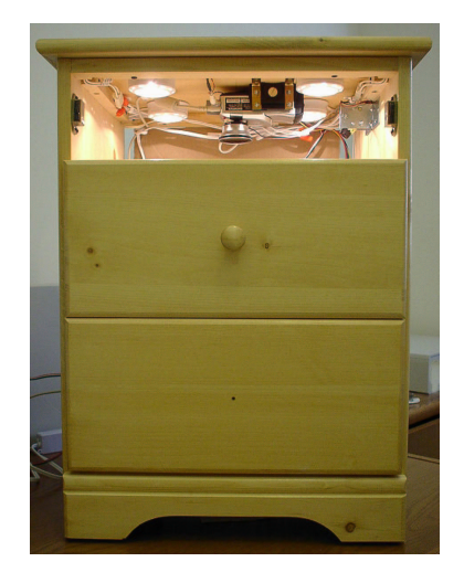
Figure 2: The Strata Drawer has a digital camera (upper center) and a laser diode (upper right) that is used to measure the height of the contents.

Strata Drawer, seen in Fig. 2 is our prototype of a camera-enhanced cabinet used for storage. This cabinet has a single, deep drawer equipped with a camera, a height-sensor and a computer. When a user places an object in the drawer and closes it, a photograph is automatically taken, and the height of the contents is measured by