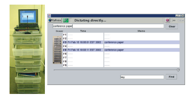
Figure 1: The Timestamp Drawers ( left ) and a close-up of the display ( right ).

ambient communication tool for everyday things. Rather than augmenting traditional organizer functions, such as assisting in the location of stored items in a chest of drawers, we might make them a new communication device that will be used to connect distant family members or co-workers. Everyday objects that support informal, lightweight communication form the second area of application that we have explored for Digital Decor. Embedded sensors and computers can transmit salient aspects of a person's everyday use of certain objects to someone in a distant location and in so doing foster a sense of connectedness between them. For example, a picture of the objects inside a child's toy box, if transmitted into the grandparent's home, could foster further communication between a grandparent and a grandchild. Further, by co-opting an object's original, tangible operations (for example: open the lid and place an object in the toy box) to also cause a picture of the contents to be sent to the remote location, we can make a communication device that is as simple to use as the original.