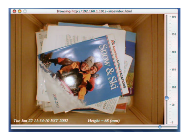
Figure 4: The Strata Drawer has time and height sliders to browse through the stack of objects that are in the drawer.

second picture of the drawer contents illuminated by the laser line. This results in a set of images as seen in Fig. 3.