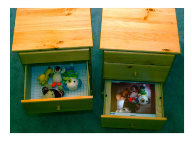
Figure 5: Overview of the Peek-A-Drawer. The photograph of the upper drawer in one cabinet is displayed in the lower drawer in the other cabinet.

functions as a storage unit and family members in a home often share its contents. For this reason, it seems like a natural choice to augment drawers to provide a virtual shared space for use by people in separate homes.