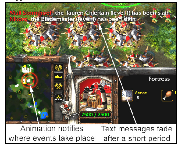
Figure 4: Calm messaging in Warcraft III. Text messages fade after a short time. Animated red concentric circles and arrows show the user where an event is taking place and recorded voice is used to communicate the type of event.