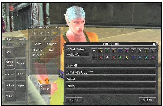
Figure 3: Everquest's easy to use macro builder (right), palettes of customized components (left), and a component stuck to the mouse pointer being dragged to a new location.