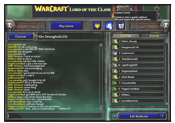
Figure 2: Battle.net, the meeting place for Warcraft III players. Players can chat, view each others' rankings, build custom games, join games, or use a matchmaking service to automatically find collaborators based on preferences.