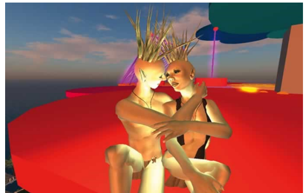
Figure 5. “Kissing and hugging” with alien avatars.