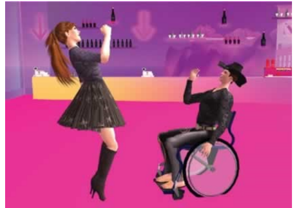
Figure 4. Initial meeting and dancing scenario

Participants were then asked to consider eleven questions related to their perceptions and/or experience with cybersex, how they wanted themselves and partners to be represented, levels of control and fantasy, perceptions of disability and cybersex or sex, and finally their reaction to the IIS that was demonstrated.