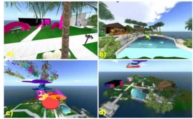
Figure 2. IIS Island: a) night club and a private home with connecting brick pathways; b) pool area with beach entry; c) floating “hang-out” area; and d) full island birds-eye view.