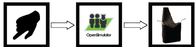
Figure 1: System diagram of the IIS.

Figure 1 provides a high level system diagram of IIS. Users would provide input to the system through various possible devices including touch-based input, mouse/keyboard, and other USB enabled devices. The open source OpenSimulator (OpenSim) [20] environment is used to host the virtual elements of the system, including virtual objects such as trees, structures, sky components typically found in virtual world settings, as well as customizable avatars. Audio, visual and tactile output is then provided to users (same or different user, in person or remote) using speakers, screens and the Emoti-chair [14]. Details of each block are described in subsequent sections.