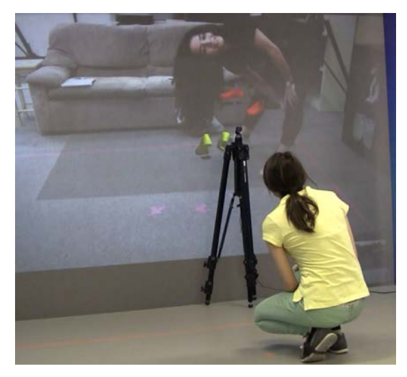
Figure 4. P10 and P11 trying to communicate by squatting so they can see one another's faces as a sign of attention.

For the dance-learning phase, the feet embodiments were useful to follow and learn the steps for most of our participants. Many tutorial videos were captured from multiple cameras, and the changes in view meant that while they were inherently interesting to watch, they were challenging to understand. The feet embodiments provided a consistent view both of the teacher (i.e. the person in the dance video), and the participant.