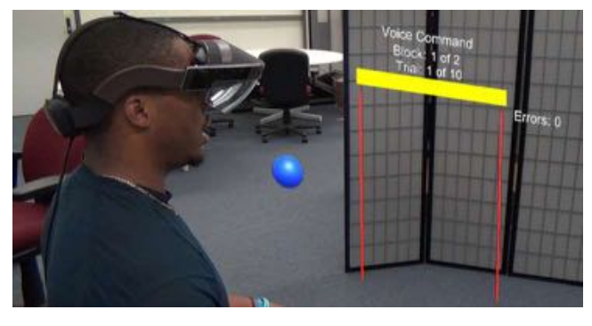
Figure 1: The design of the virtual environment and experimental setup for our study.

While mode switching techniques have extensively been formally evaluated for pen and touch-based interfaces, we are unaware of any work that empirically evaluates mode switching for use in AR headsets. These headsets differ from device-based AR